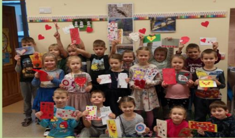
Greetings from Latvian project participants!