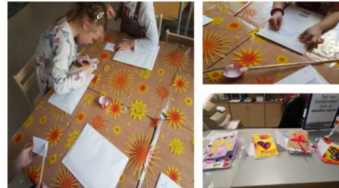
Latvian partners write letters to friends 😊